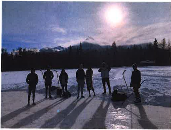
On the lake at Lunch hour

Notice of Caution: Now that the weather is warming please stay OFF the ice on hospital lake.